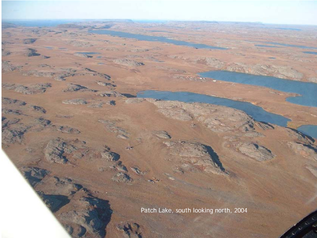
Patch Lake, south looking north, 2004